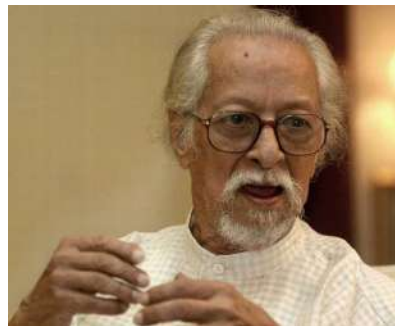
Chidananda Dasgupta Film maker and critique