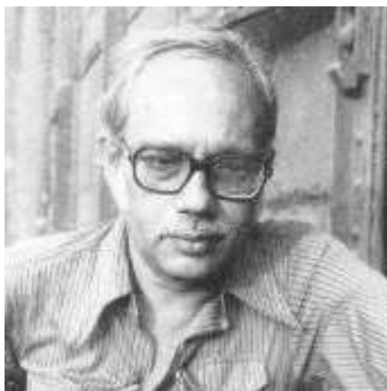
Shakti Chattopadhyay Bengali poet