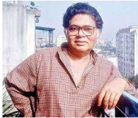
Sunil Gangopadhyay Bengali litterateur