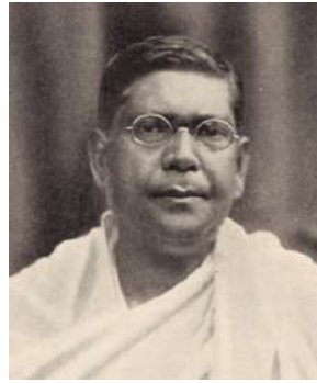
Deshbandhu Chittaranjan Das Freedom fighter