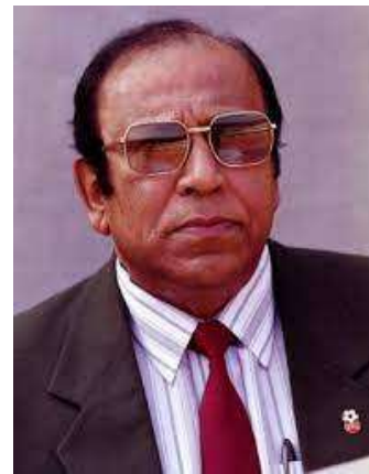
P K Banerjee Footballer