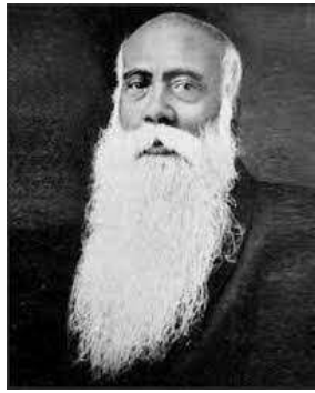
Acharya Brajendranath Sil Polymath