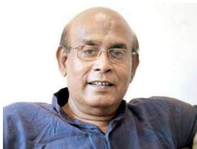
Budhadeb Dasgupta Film maker, Poet