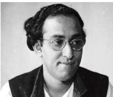
Narayan Gangopadhyay Bengali litterateur