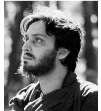
Soumitra Chattopadhyay Performing artist, poet, editor