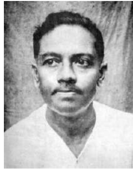
Jibanananda Das Bengali Poet