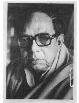
Debiprasad Chattopadhyay Philosopher