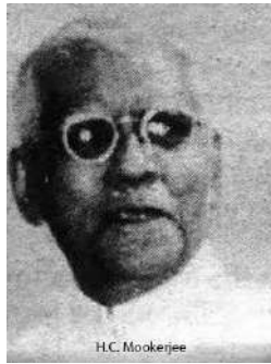
Harendra Kumar Mukherjee Former Governor of West Bengal