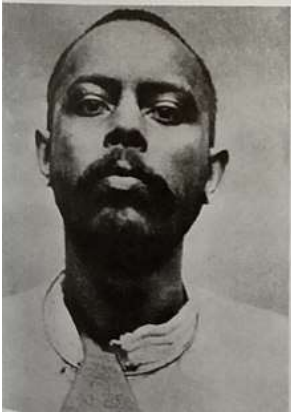
Ullaskar Dutta Freedom fighter