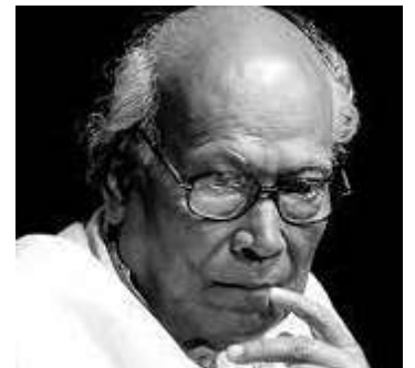
Shankha Ghosh Bengali Poet