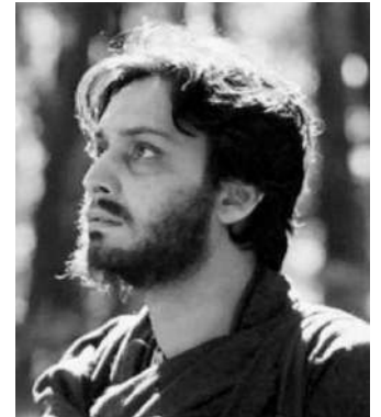
Soumitra Chattopadhyay Performing artist, poet, editor