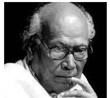
Shankha Ghosh Bengali Poet