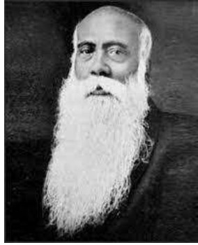
Acharya Brajendranath Sil Polymath