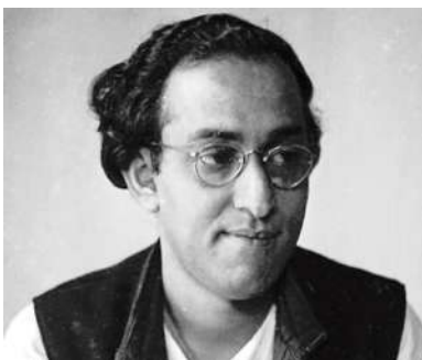
Narayan Gangopadhyay Bengali litterateur