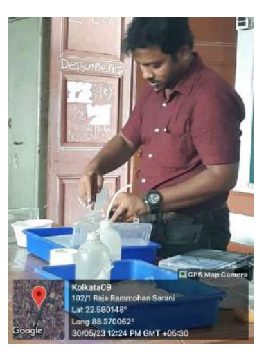
Photoplate: Some glimpses from the Workshop